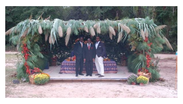
Booth, Feast of Tabernacle Convocation, 2015, Sylvania, Ga

Yahweh (the LORD) Father (God) Tabernacles with men forever