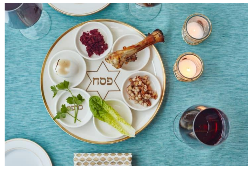
PASSOVER SEDER THE PASSOVER & FEAST OF UNLEAVENED BREAD April 22 – 30, 2024

Sponsored by Brit (Covenant) Congregation East and West